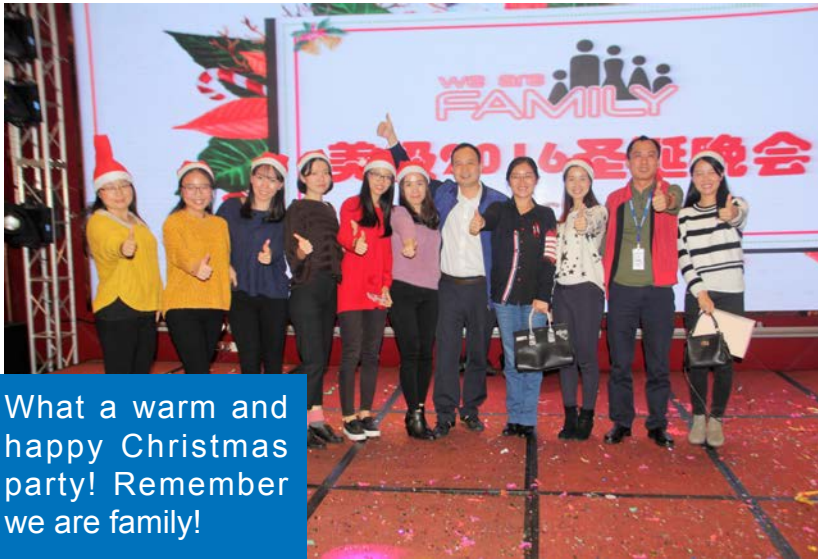
What a warm and happy Christmas party! Remember we are family!