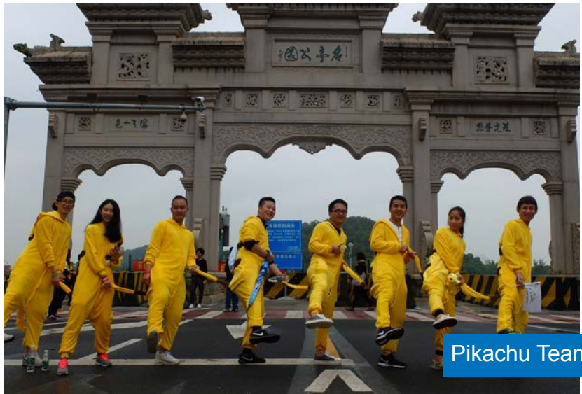
Tired but happy